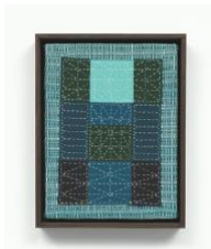
Paolo Arao Étude (Breakers) , 2024 Hand-stitched cotton thread, pieced + sewn cotton and denim, and hand-woven cotton in a wood frame 12 x 9 in. (30.5 x 22.9 cm) (PA 24111)