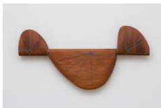
Paolo Arao and Gregory Benson Respire II , 2024 Redwood, natural finish, brass, and cotton embroidery thread 16 x 34 x 2 in. (40.6 x 86.4 x 5.1 cm) (PA 24128)