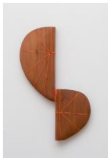
Paolo Arao and Gregory Benson Respire I , 2024 Redwood, natural finish, brass, and cotton embroidery thread 21 x 15 x 1.75 in. (53.3 x 38.1 x 4.4 cm) (PA 24126)