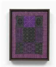
Paolo Arao Étude (Constellation) , 2024 Hand-stitched cotton thread, pieced + sewn cotton and denim, and hand-woven cotton in a wood frame 12 x 9 in. (30.5 x 22.9 cm) (PA 24110)