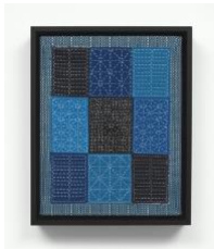
Paolo Arao Nocturne (Tides) , 2024 Hand-stitched cotton thread, pieced + sewn cotton and denim, and hand-woven cotton in a wood frame 14 x 11 in. (35.6 x 27.9 cm) (PA 24117)