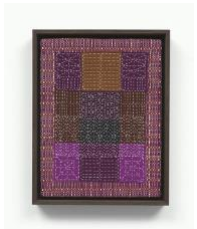
Paolo Arao Étude (Sanguine) , 2024 Hand-stitched cotton thread, pieced + sewn cotton and denim, and hand-woven cotton in a wood frame 12 x 9 in. (30.5 x 22.9 cm) (PA 24114)