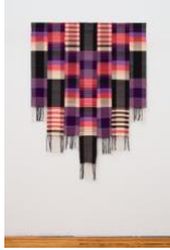
Paolo Arao Intervals (Nightfall) , 2024 Handwoven cotton and wool 66 x 48 in. (167.6 x 121.9 cm) (PA 24068)