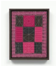
Paolo Arao Étude (Galaxy) , 2024 Hand-stitched cotton thread, pieced + sewn cotton and denim, and hand-woven cotton in a wood frame 12 x 9 in. (30.5 x 22.9 cm) (PA 24109)