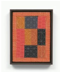
Paolo Arao Étude (Mandarin) , 2024 Hand-stitched cotton thread, pieced + sewn cotton and denim, and hand-woven cotton in a wood frame 12 x 9 in. (30.5 x 22.9 cm) (PA 24113)