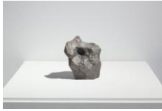
Cameron Gainer Cast I (4,600,000,000 Years) , 2012 Iron and nickel based meteorite melted and cast into its original form 5.5 x 6 x 4 in. (14 x 15.2 x 10.2 cm) (CGAIN 1401)