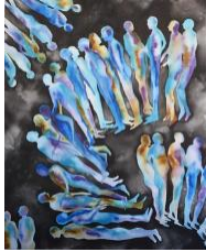
Michelle Blade Drifting , 2016 Acrylic and ink on canvas 48 x 60 in. (121.9 x 152.4 cm) (MB 1603)