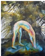
Michelle Blade What We Know , 2016 Acrylic and ink on canvas 48 x 60 in. (121.9 x 152.4 cm) (MB 1607)