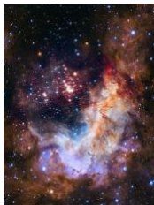
NASA/STScI Celebrating Hubble's silver anniversary , 2015 Digital print 34.5 x 27 in. (87.6 x 68.6 cm) (N 1601)