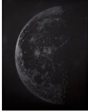
Becca Mann Half Moon , 2010 Graphite on black paper 29.5 x 23 in. (74.9 x 58.4 cm) (BMNN 1501)