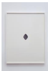
Ala Eftekar Tunnel in the Sky , 2015 Cut mat over monoprint on found book page 24.25 x 19 in. (62 x 48.3 cm) (AE 1611)